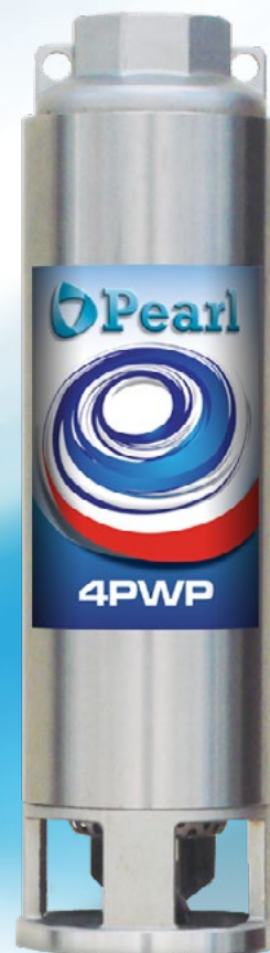
Tabla de Selección