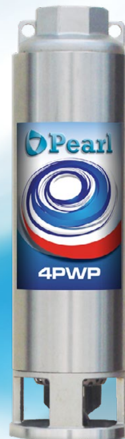
Tabla de Selección